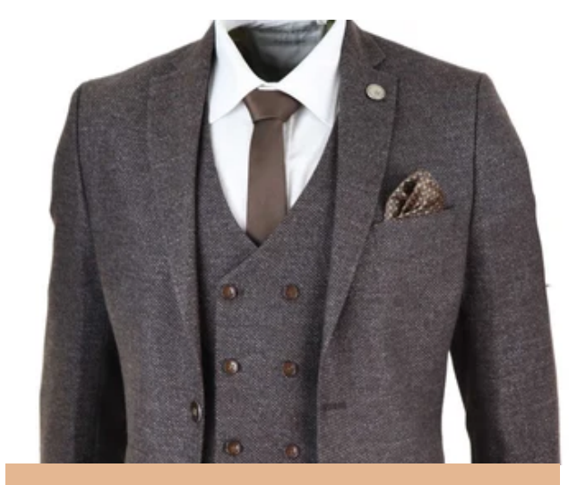
Find classic 20's men's three piece suits on Etsy.

Women who feel inclined to dress inspired by the 1920s can embrace the simplistic style, wearing clothes that highlight their natural look while staying modest, with items such as flapper dresses and dresses with long skirts. Womens' clothing during this time was also targeted more towards comfort, as they began to ditch corsets and embrace their natural selves. Ironically, corset tops are a popular item of clothing that have been trending these days. Men can reflect this time period in their clothing by wearing soft collared suits, and take inspiration from popular patterns of the decade, the most prominent being pinstripes.