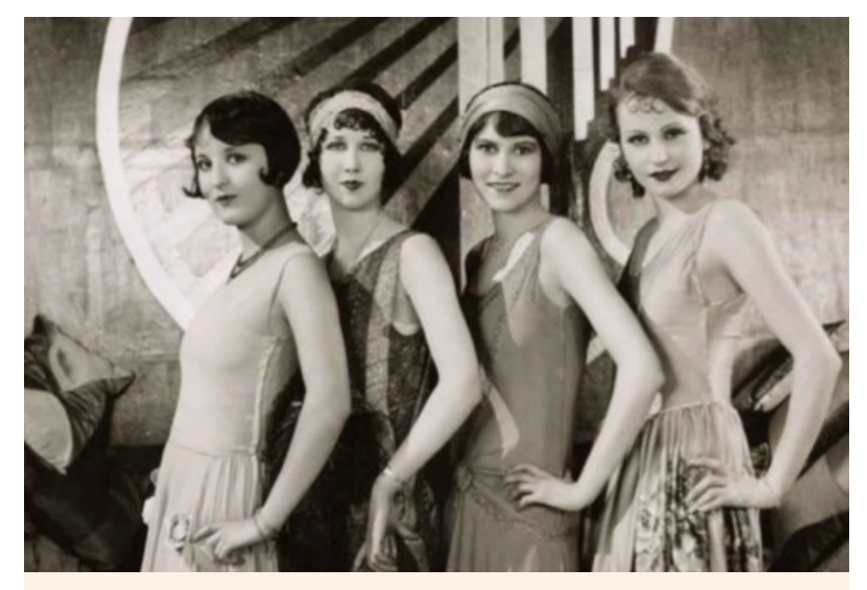
Women from the roaring 20s slayed in the fashion of their times.

Inspired by the Roaring 20s, the 2022 prom theme was announced to be "The Roaring 22s." With the dance rapidly approaching, Centurions begin to pinpoint their favorite looks from the iconic 20s style of fashion in order to decide upon their outfits and whether they are going to dress according to the theme.