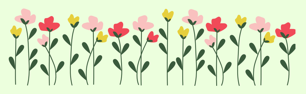
The Centurion Spotlight is produced monthly by the students in the Journalism Class in Room 325.