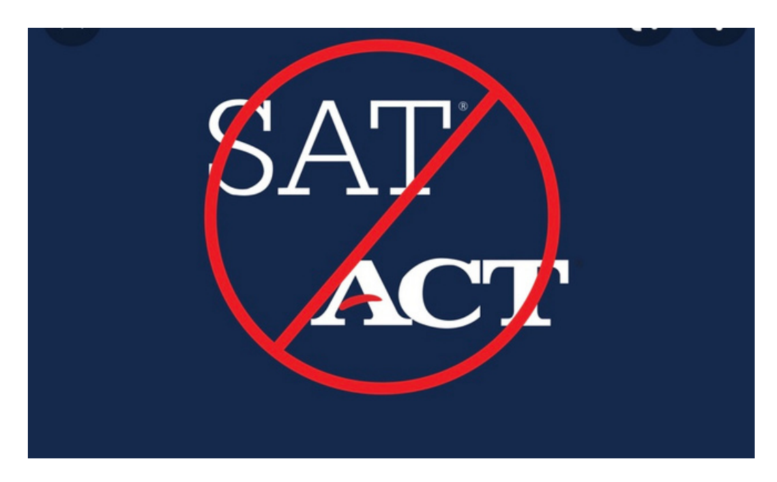
College board requires no more SAT at CSU

Last month, on March 23, the Cal State system (CSU), following the lead of the UC system in 2020, discontinued the SAT and ACT admission requirements. They made this decision because some educators felt that test scores were unfair, especially toward low-income or minority students.