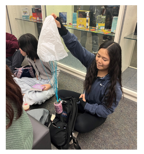
A physics student prepares her parachute to protect her egg.

Even though some students' eggs did not survive, the class still learned about key physics principles.