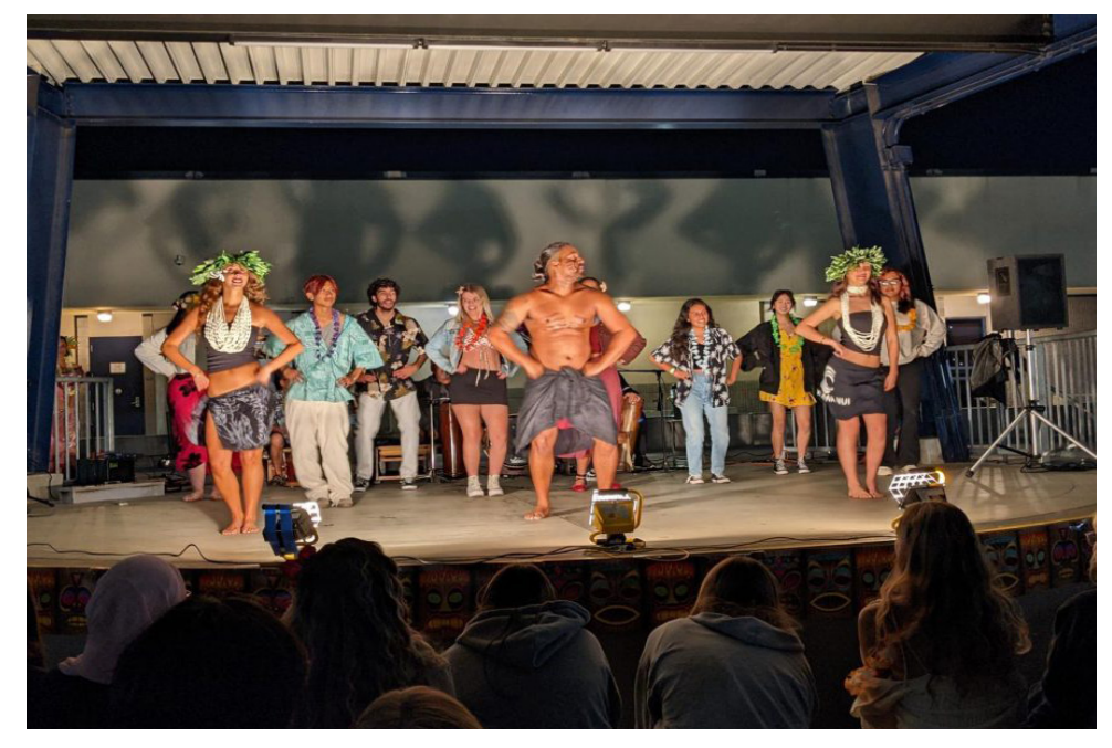
Some lucky students received a hula lesson from the fire dancer.

November 2 marked the highly anticipated Senior Luau event at Cypress High School. The senior-exclusive included live music, spectacular shows, and the impressive fire spinning display.