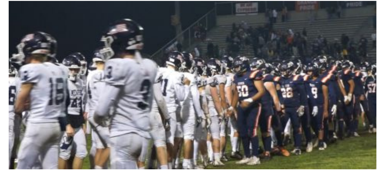
Cypress players congratulated their opponents after another close game and nail-biting finish.