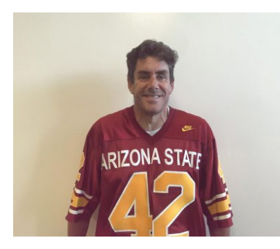
This is my first year in Cypress,