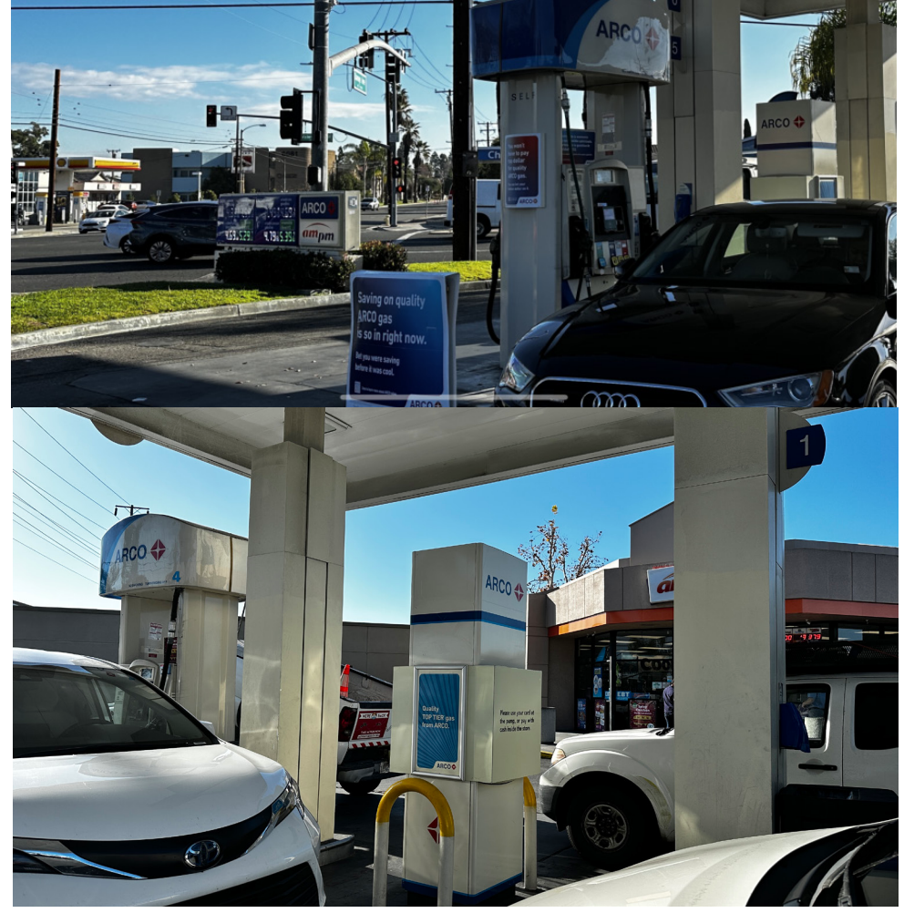
The gas station, Arco is the most visited gas station next to Cypress High School and their gas prices are around $4.79.

Hopefully, the gas prices drop next year because the drivers in Cypress are having a hard time providing for both gas and their necessities.