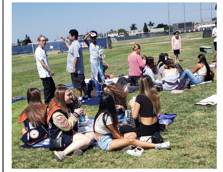
Best Buddies meets on the field on Thursdays.

Best Buddies's December 8th holiday party in the Media Center breathed some holiday spirit into an overworked Cypress High. This year's holiday party isn't the club's first, and they hold events around the holidays to