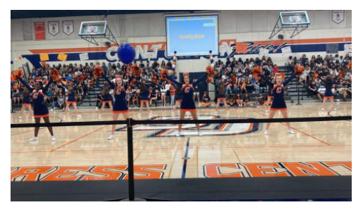
Cypress cheer bring joy and spirit to the students of Cypress.

Wrestling is one sport that is a good activity to join and make some friends.