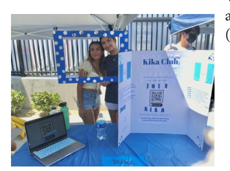
Club rush helped students find groups to join.

you belong at Cypress to have an amazing time and year.