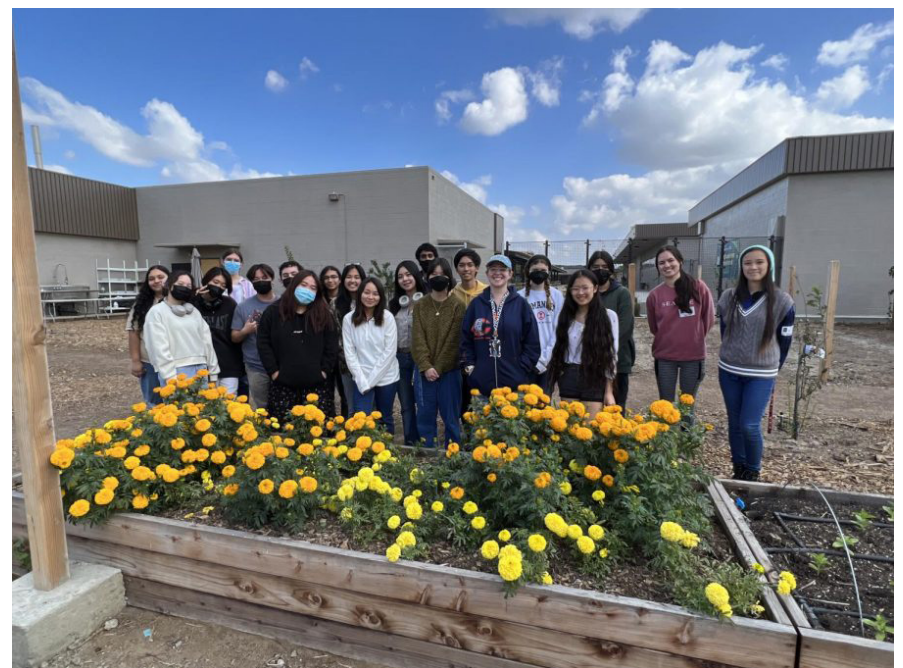
AP Environmental Science Students at the Magnolia Agriscience Community Center.