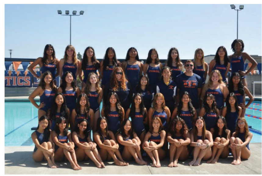
Girl's Varsity won League Finals.

The swim team that has made Cypress proud was the Girls varsity swim team. They have done an exceptional job this season by winning