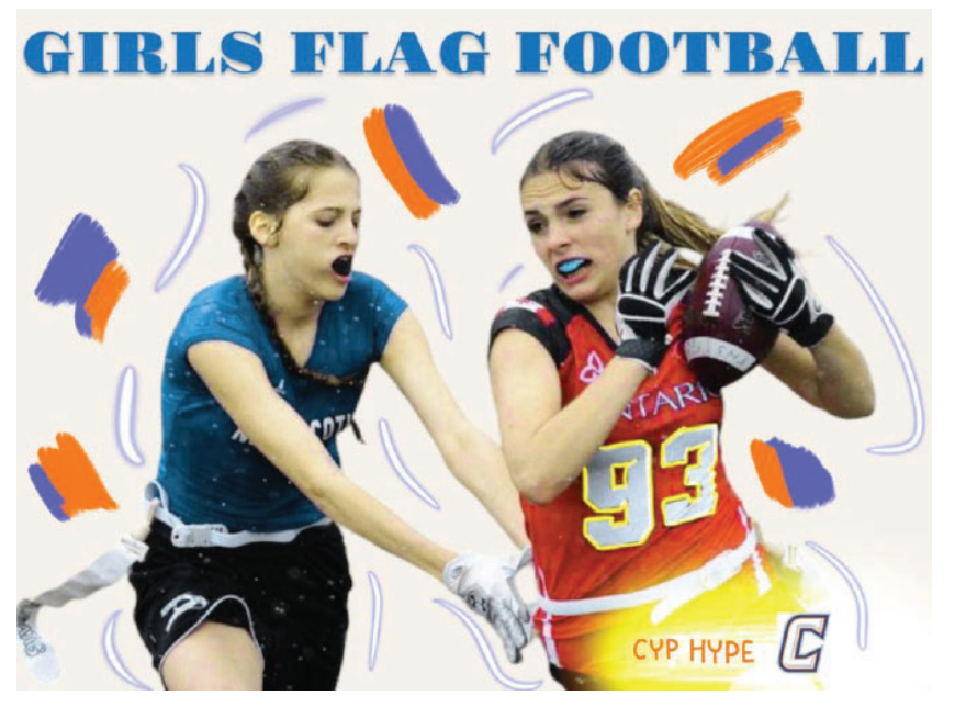
Flag Football is coming to Cypress High! Are you ready? (Collage credit: Lauren Kim)

The lady Centurions are getting ready for the new addition that is coming to Cypress athletics and that is... Flag Football!