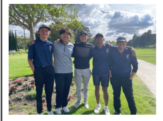
Boy's Golf, League Championships Sports, page 7