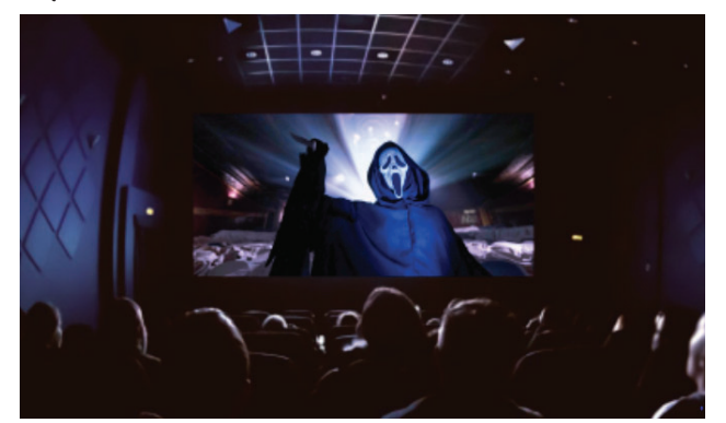
Scream VI comes to theaters with new characters, stories, and Ghostface.

A new Ghostface made its bloody debut in New York City in the new Scream VI movie. Coming after Scream (2022), Scream VI, directed by Matt Bettinelli-Olpin and Tyler Gillett, became a worldwide success being released in theaters around