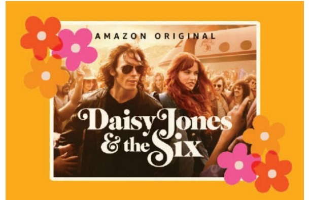
Daisy Jones and the Six on Prime Video

The show is a great depiction of 1970s bands and music. The show