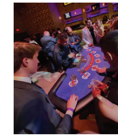
Students tried their luck by gambling in the casino room.

was music, refreshments, and appetizers waiting for them. The venue had two floors; the first floor was the dance floor along with seating, as well as an enclosed casino room for students to gamble or hang around with food and refreshments. Some popular gambling games among students were Black Jack and roulette.