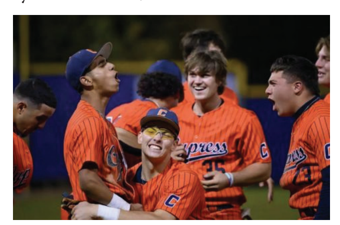
With a strong teamwork and determination, Cypress baseball won the CIF-SS Division 1 game.

The Cypress High School baseball team continues to make his-