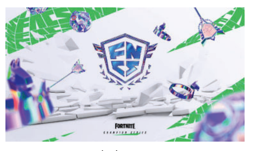
Fortnite Tournament Features, page 2