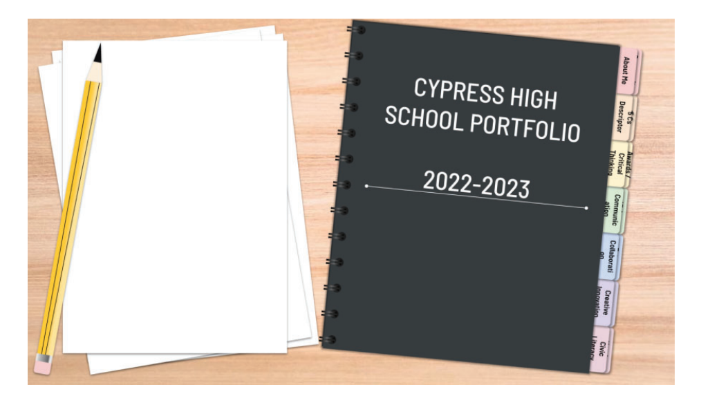
Each senior created a personalized slideshow to showcase their high school achievements and expereinces.

The student perspective is important too, some may argue, the cornerstone of the project to begin