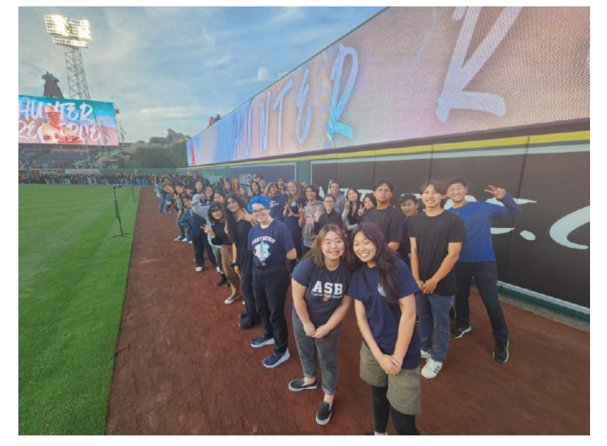
Centurions getting ready to sign at the Angel's game.