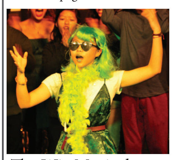
The Wiz Musical Student Activities, page 5