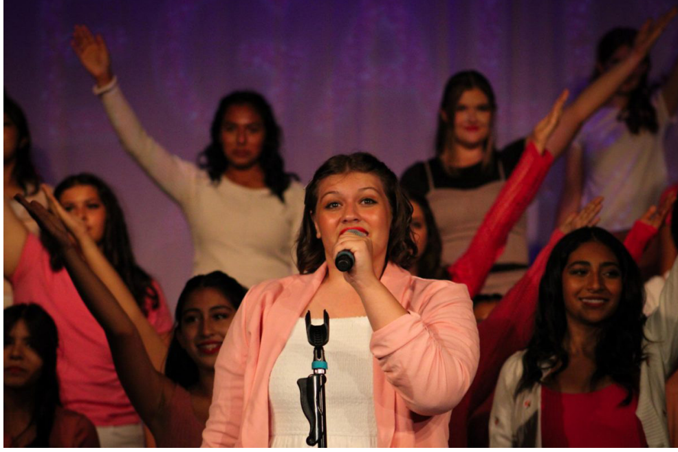
Pink Thunder performing "So Much Better" from the movie Legally Blonde.