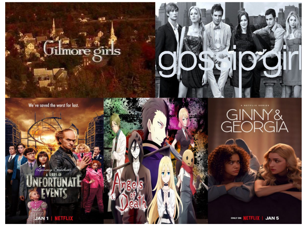
The top five shows to binge-watch during this Fall season.

By Brianna Naranjo, Features Editorand Student Activities