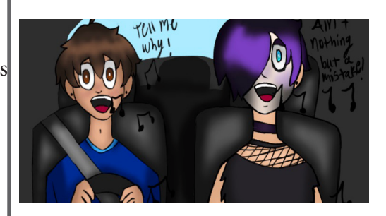
Cartoon of the driving process

Getting a driver's license is a once-ina-lifetime landmark in many people's lives. It gives you the freedom to travel anywhere you want to go. Either it's work or you want to explore the world. This is a step by step guide on how to get your driver's license. Before starting your process on getting your driving license, you must meet the California requirements for applying. To do so, you must provide proof that you are a Californian