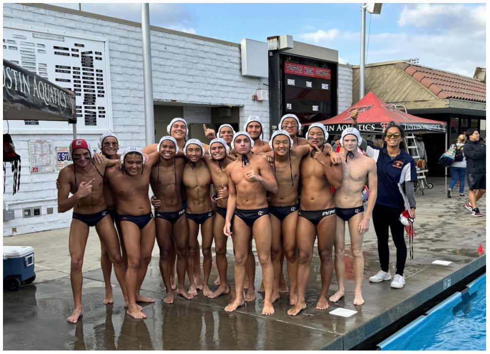
The Cypress High School Boy's JV Water Polo team defeated Tustin High School.

As boy's water polo comes to an end, the water polo team leaves us in awe of their dedication, resilience and unwavering spirit in the pool.