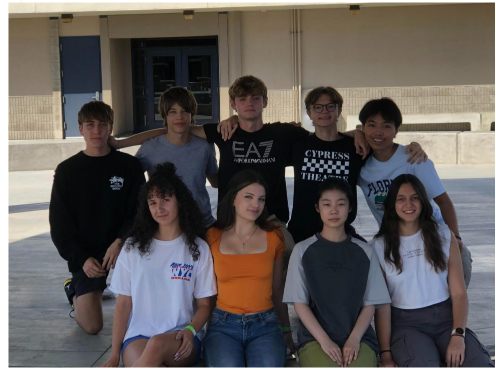
This year all the foreign exchange students come from all over the world..

This year Cypress welcomes nine foreign exchange students. Each new student brings an extraordinary background. It sets up experiences that enrich our campus. The new arrivals have embarked on their journey of learning American culture.