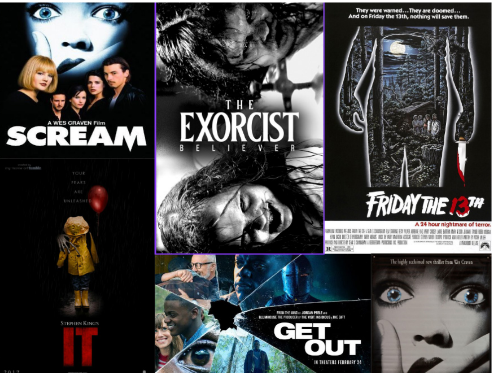
Halloween means it's time for horror movie viewing!

on slightly actual events. Halloween is the time for spooky scary movies. Scary movies can be enjoyed with anyone and can be in the background while carving pumpkins, baking, watching a scary movie in general, or even while completing a spooky activity.