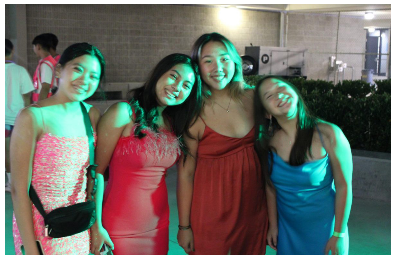
Hanging out with friends was one of the top reasons to attend the Homecoming Dance.

On September 16th, 2023, in the school's quad, the students of Cypress got a blast from the past with this year's Back to the Future and 80's theme—students dressed in neon, 80's, and Back To The Future clothing. The Homecoming dance had 80's arcade machines, corn dogs, lemonade, and shaved ice. This party was a huge hit with students who enjoyed the retro theme.