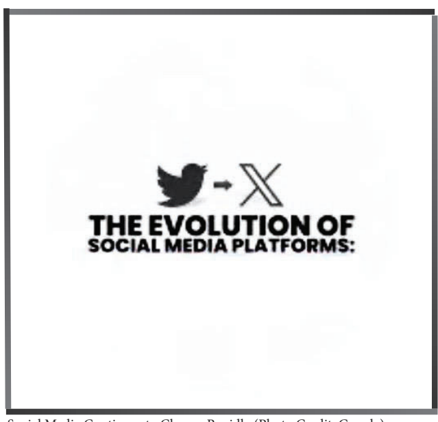
Social Media Continues to Change Rapidly

fan of the old or eager to explore the new, one thing is certain: social media will always be dynamic.