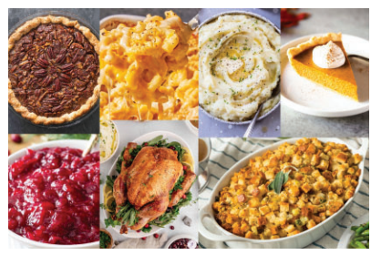
There are always so many dishes to try during the holidays.

With Thanksgiving right around the corner it can be hard to think about food to cook, bake, or buy that everyone will enjoy. Hearing family and friends complain about it or someone not being able to eat it due to dietary restrictions can be hard, but this list will help with ideas and recipes to help in these difficult situations