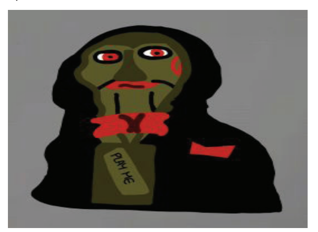
Jigsaw's puppet, Billy was used to relay a message to the players of his game.

The horror franchise, "Saw" released another gruesome film, "Saw X" to theaters in September 2023.