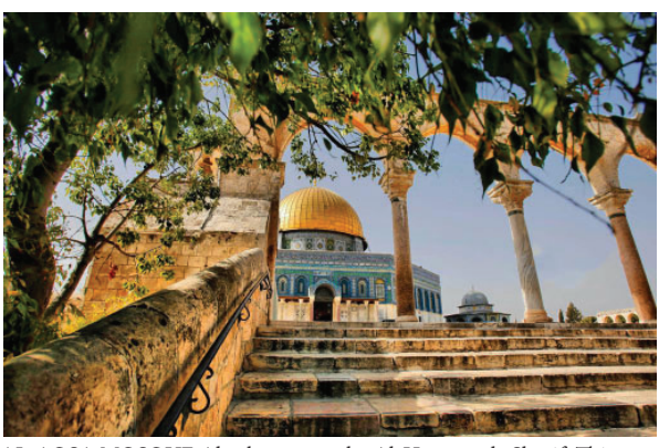
AL-AQSA MOSQUE Also known as the Al-Haram ash-Sharif. This mosque is the third holiest shrine for Muslims. Excerpt from Palestines Ministry of Tourism & Antiquities.

With many people calling for a ceasefire, the UN voted in October 2023, a total of 120 countries voted in favor of the resolution, 14 countries voted against including Israel and the United States, while 45 others abstained. And like Malcolm X once said: "If you're not careful, the newspapers will have you hating the people who are being oppressed, and loving the people who are doing the oppressing."