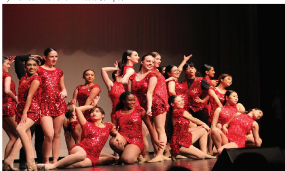
Advanced Dance at the end of their number "I LOVE Cypress" during the "Rock This Town" dance concert.

The first dance concert of the 2023-2024 school year, "Rock This Town" featured PE Dance classes along with Advanced Dance Class. The "Rock This Town" showcase was held at Kennedy High School in the Performing Arts Center. The 2023 Dance Show was a hit, having a full house at the Kennedy Performing Arts Center.