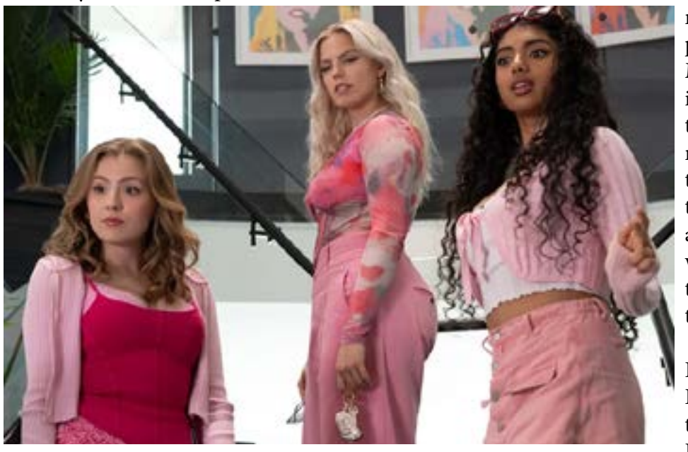
On Wednesday we wear pink!