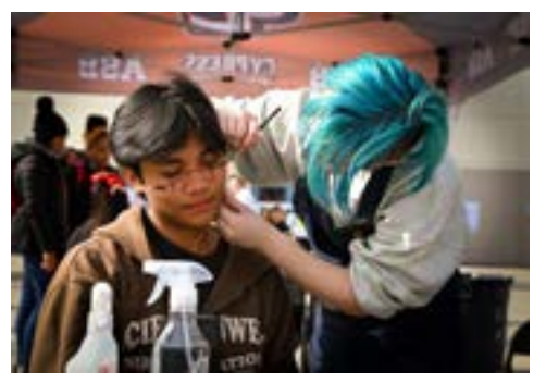
Activities in addition to basketball included face painting, provided by CHS theatre and Ms. Stewart.