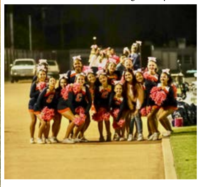
JV Cheer used pink pom poms during breast cancer awareness month.

These school-spirited students continue to use their amazing opportunities to support Cypress and even make new friends along the way.