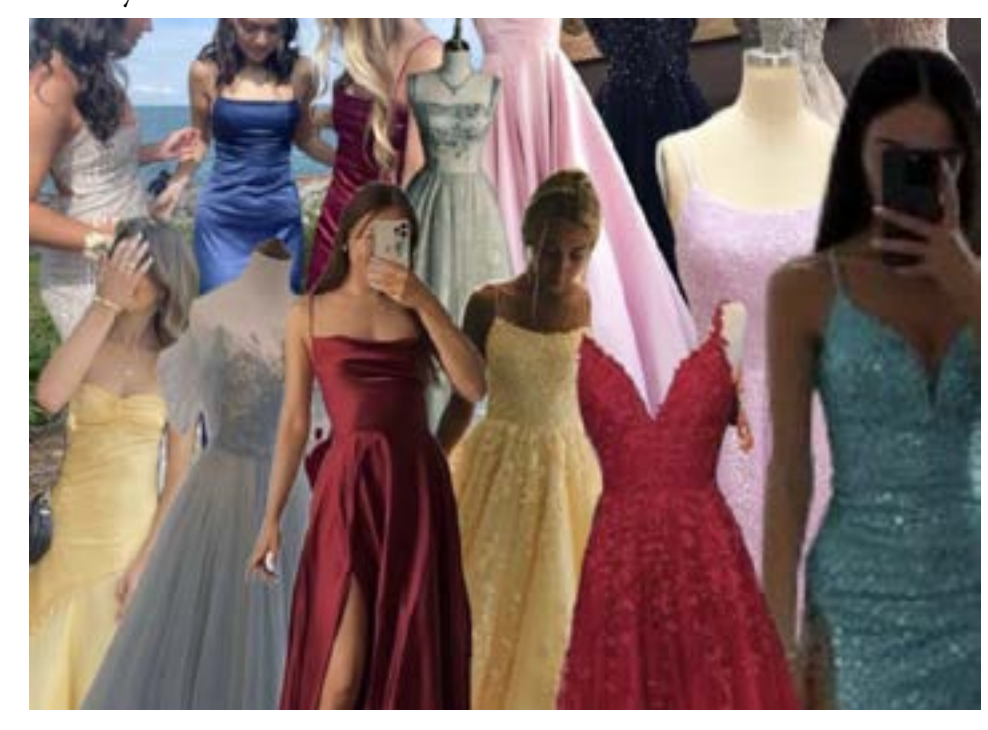
Photo above provides examples of what to wear to formal.

As Winter Formal approaches, students become more desperate, struggling to find appropriate clothing options to wear to the dance. It's the perfect time to plan your outfit and ensure you're dressed to impress. In this article, we'll explore some simple yet stylish ideas for both guys and girls attending a high school winter formal. As the theme of the evening is northern lights, some may want to stick with the items below.