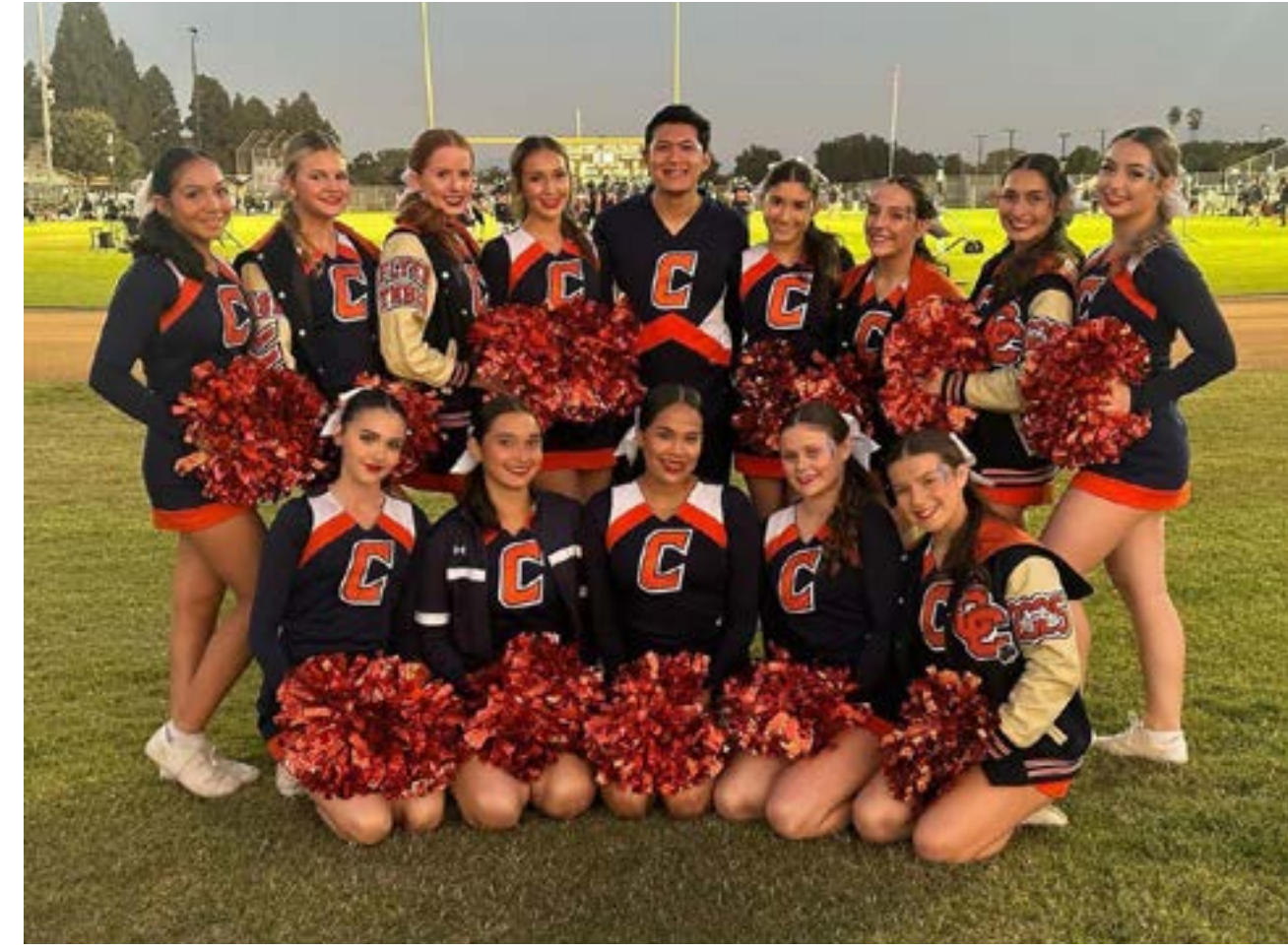
The Cheer team competes in various competitions during the year. They recently performed in London.

The cheer and song team is made up of over 50 students split into three divisions, Frosh, JV, and Varsity. Every school year the team has many opportunities to cheer at athletic events such as basketball and football games to pump up the crowd. The cheer and song team also get to go to many different competitions.