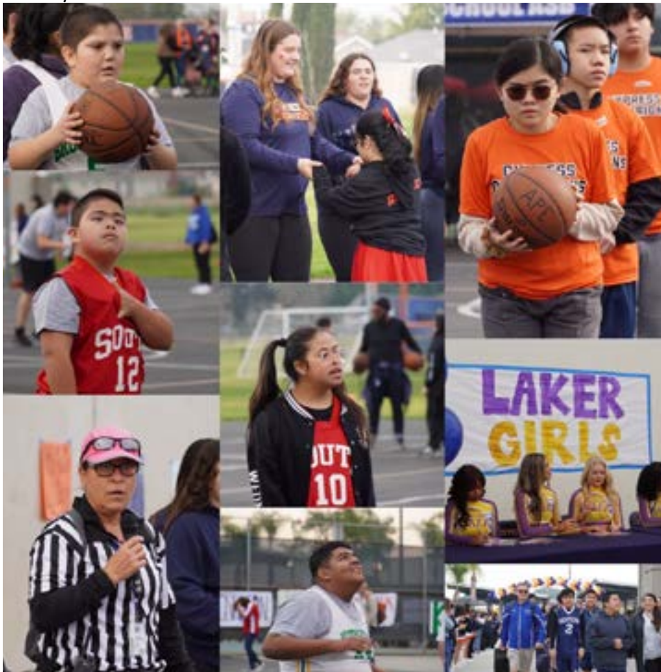
Cypress proudly welcomed students from all over the district for the SYS Basketball Tournament.

On January 19th, AUHSD held its annual Special Youth Service Basketball Tournament at Cypress High once word got around that the original host of the occasion (Loara High) would have to go under some renovations earlier than expected. Schools from all over the district gathered for the annual tournament at Loara High School-up until the where Special Education students Special guests The Laker Girls even made an appearance on campus during the event. There were also special performances from Cypress'