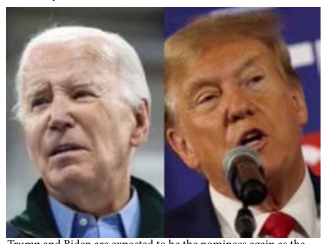
Trump and Biden are expected to be the nominees again as the parties face off in the election.

In the upcoming 2024 presidential election, a range of candidates have emerged. Notable Republican figures include Donald Trump and Nikki Haley. On the Democratic side, incumbent Joe Biden is expected to be the nominee. Ron Desantis and Asa Hutchinson were running for president but both recently dropped out. Desantis national convention. decided to endorse Trump while Asa