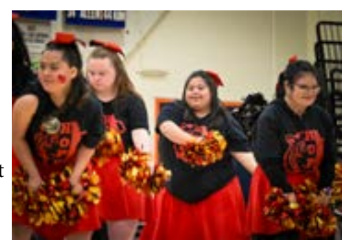
Some schools brought cheerleaders in addition to athletes.

As a result of the united front that Cypress staff and students helped provide, the event was successful and students were full of excitement. The next Special Youth Services will be held at Hope High School.