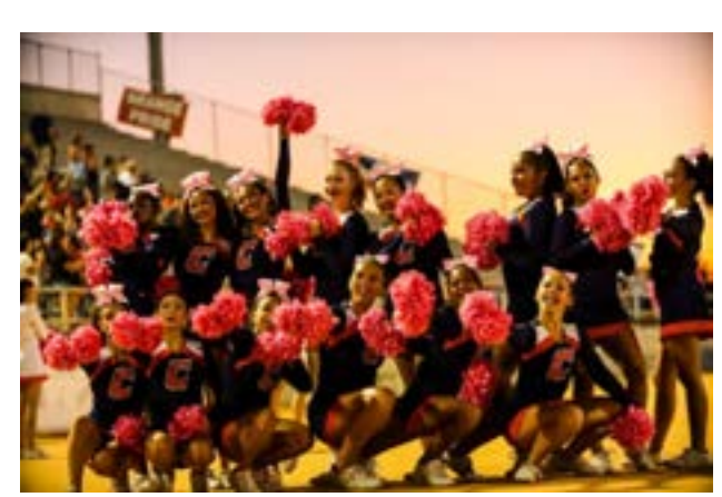
Cheer and Song do their magic at every home game!