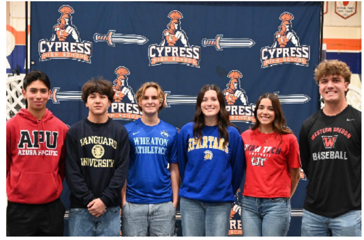
Cypress is proud of all the athletes who signed their letters of intent this month.

The long-standing tradition of the College Athletes Signing in spring began in 2010. This year it took place on February 5th, 2025. Friends and family of the students signing were invited to Cypress High School's basketball gym to celebrate the six students signing their letters of intent and moving on to the next stage of their sports careers.