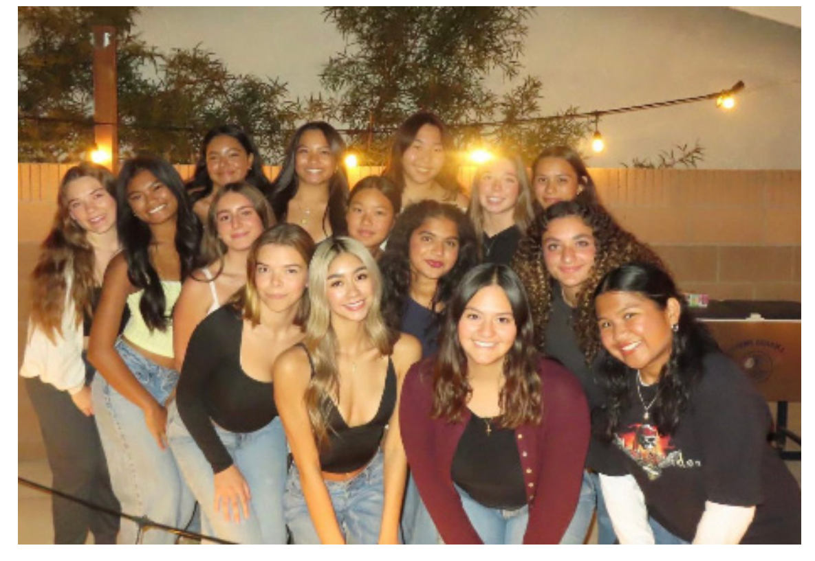
Cypress High School girls water polo seniors celebrate their last year on water polo after their last game.