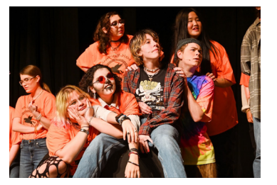
The show's quest follows encounters with other gods whose aim is to find Zeus' lightning bolt.

The Lightning Thief not only gave the audience another laugh but reminded them to value the people they have. Cypress Theatre continues to spread its creativity to the audience as the year progresses.