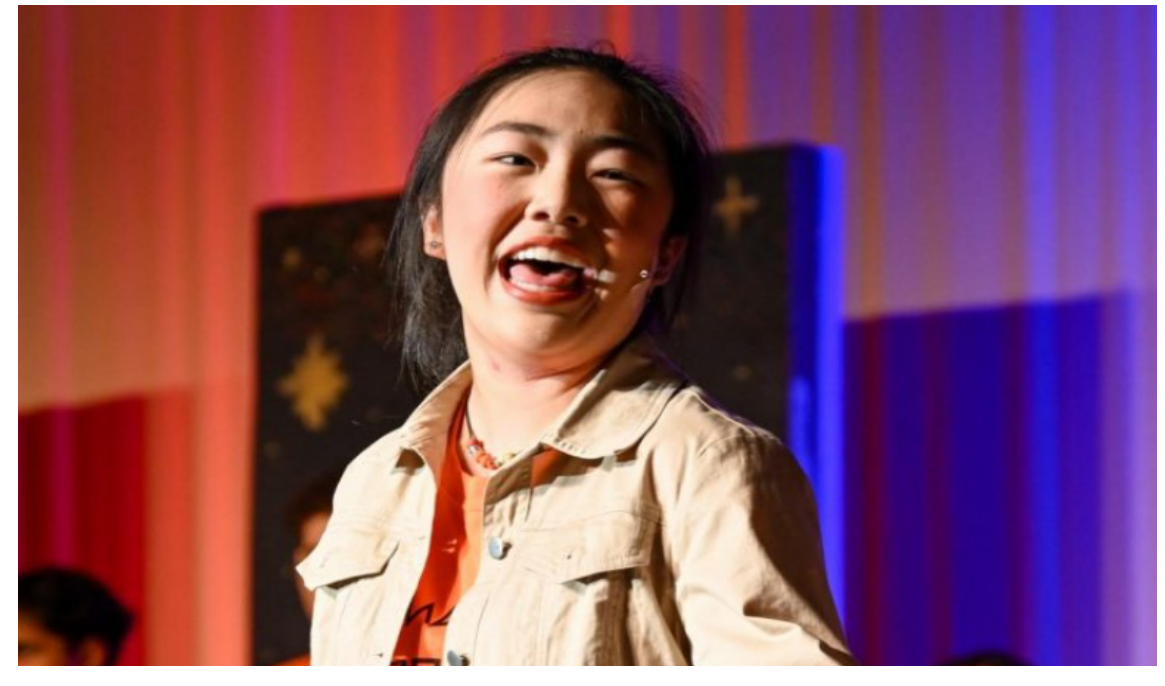
The second theatre show of the year closed their performance on February 7th.