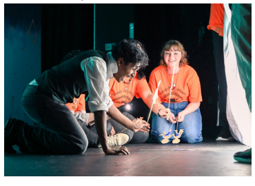
Background props were used to enhance the show for the audience.

Rick Riordan's novel has had several different adaptations ranging from movies to shows, and now musicals.